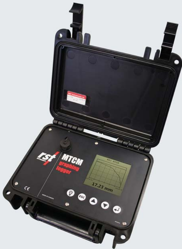
The MTCM - Graphing Logger is a rugged and compact unit that is also light-weight and can be easily carried in one hand.