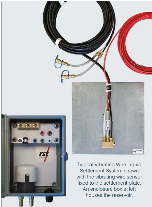
Typical Vibrating Wire Liquid Settlement System shown with the vibrating wire sensor fixed to the settlement plate. An enclosure box at left houses the reservoir.