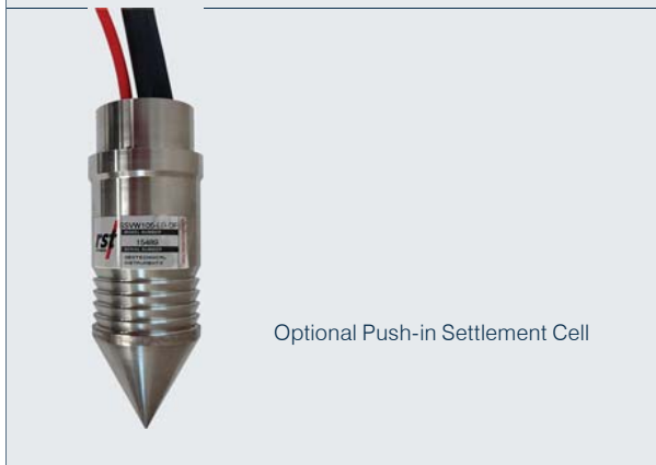
Optional Push-in Settlement Cell