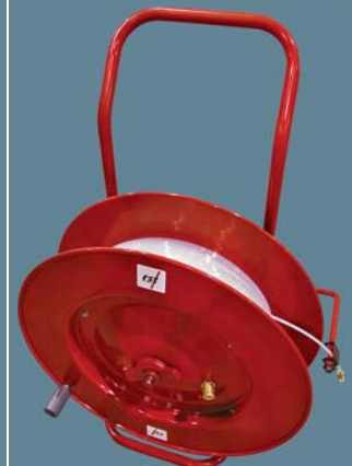
Portable Inflation Line Reel