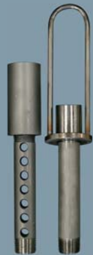
Swivel Line Adapter (left) and Lifting Bail

Feed-through Adapters allow instrument leads to be passed through the packers to pumps and other equipment in the zone below the packer.