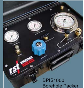
BPIS1000 Borehole Packer Inflation System