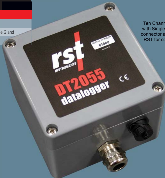
Ten Channel Data Logger with Single Gland; optional connector available, contact RST for complete details.

GEOTECHNICAL . MINING . ENVIRONMENTAL . STRUCTURAL