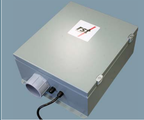
FlexDAQ Datalogger in weatherproof enclosure