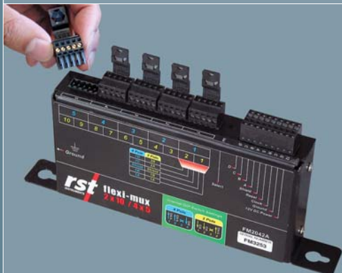
Flexi-Mux Multiplexer for increasing number of sensors