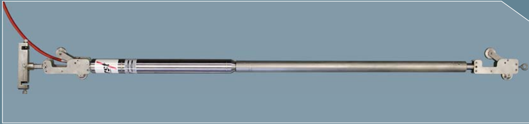
Horizontal In-place MEMS Inclinometer showing detailed structure of the wheel assembly.

The Horizontal In-place MEMS Inclinometer is designed to remotely monitor, and continuously measure, underground vertical movement as a result of construction and excavation and any settlement that may occur around tunnels, dams, embankments and landfills.