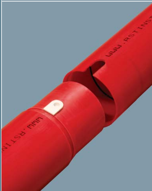
Snap Seal Inclinometer Casing

RST's Inclinometer Casing is engineered to be assembled quickly and accurately for long and short term monitoring in the most adverse field conditions. RST Inclinometer Casing is suited to be installed in boreholes, embankments, piles, set into concrete or attached to structures. It's compatible with all commercially available inclinometer probes, including RST's MEMS Digital Inclinometer Probe. RST manufactures Inclinometer Casing with precision CNC technology.