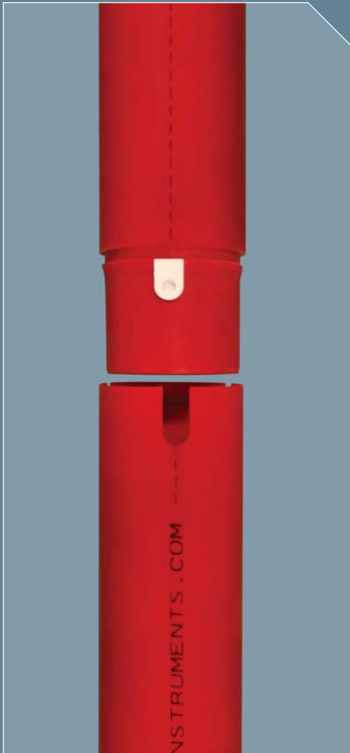
Glue and Snap Inclinometer Casing