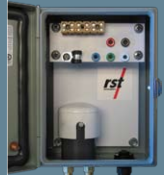
Typical enclosure box.