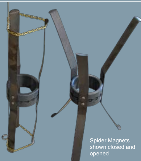
Spider Magnets shown closed and opened.

A portable system to monitor either heave or settlement in soil and rock. Installation may be either as a single purpose device to monitor settlement/heave only, or in conjunction with RST flush-coupled inclinometer casing to obtain both vertical and horizontal deformation data from a single installation. The system is simple, accurate, and has proven long term reliability at low cost.