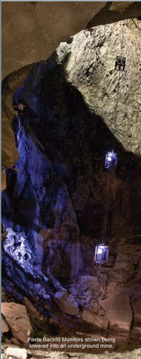
Paste Backfill Monitors shown being lowered into an underground mine.

RST's Paste Backfill Monitors are used in mine paste backfill to achieve improved extraction and to increase safety. They provide useful engineering feedback to allow paste and stope design to be optimized.