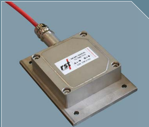
Standard Submersible Tiltmeter on a Mounting Plate