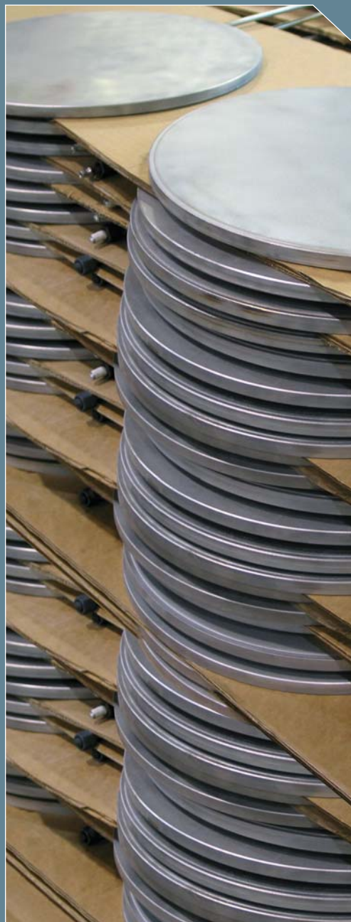
An order of Total Earth Pressure Cells being prepared for shipment.

Total Earth Pressure Cells are designed to measure stress acting on plane surfaces. The TP-101 series Total Earth Pressure Cells are constructed from two circular stainless steel plates, welded together around their periphery. The annular space between these plates is filled with deaired glycol. The cell is connected via a stainless steel tube to a transducer forming a closed hydraulic system. The stress is then converted to a signal and may be remotely read on a variety of portable readout units or data loggers. Various types of transducers are employed dependent on site requirements.