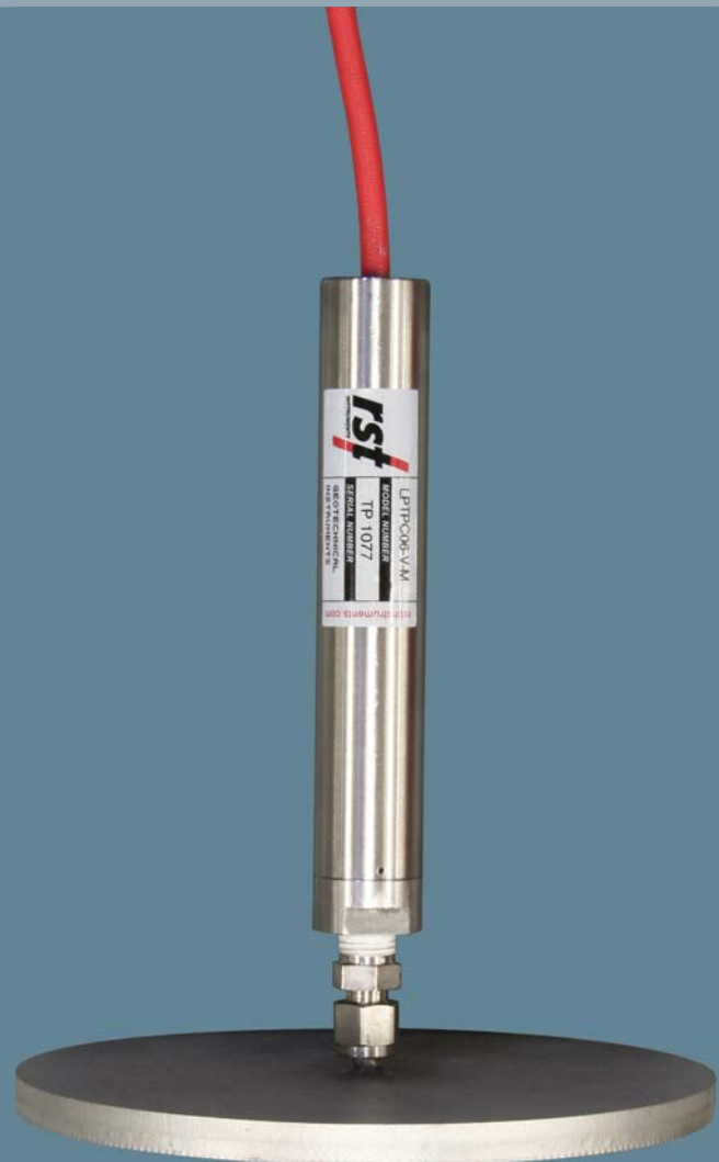
Total Earth Pressure Cell - Axial Mounted Model LPTPC06-V-M

GEOTECHNICAL . MINING . ENVIRONMENTAL . STRUCTURAL