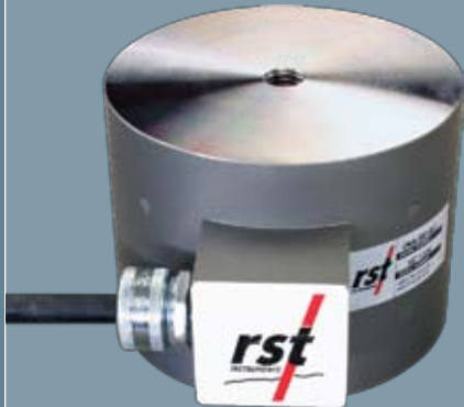
Solid Load Cell