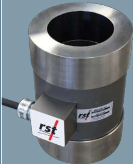
Annular load cell shown with top and bottom platens.

Vibrating Wire Load cells are available in both solid and annular styles to monitor compressive loads. Load elements are manufactured from high tensile, heat treated, stress relieved steel, with precision bearing surfaces. Machined overall, high tensile matching load platens are recommended to provide a smooth parallel bearing surface and spread the load.