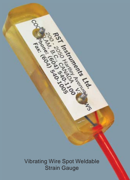
Vibrating Wire Spot Weldable Strain Gauge

RST Vibrating Wire Strain Gauges are designed to be welded to or embedded in various structures for monitoring strain. RST vibrating wire strain gauges are available in 3 models: VWSG-A, for arc welding to steel structures; VWSG-S, for spot welding to steel structures; VWSG-E and VWSG-EL, for embedment in concrete.