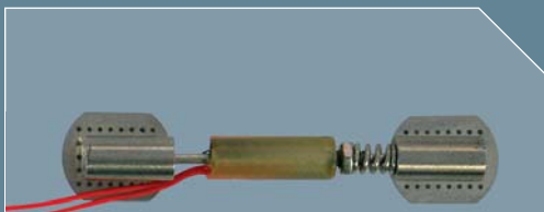
Vibrating Wire Spot Weldable Strain Gauge - Low Profile