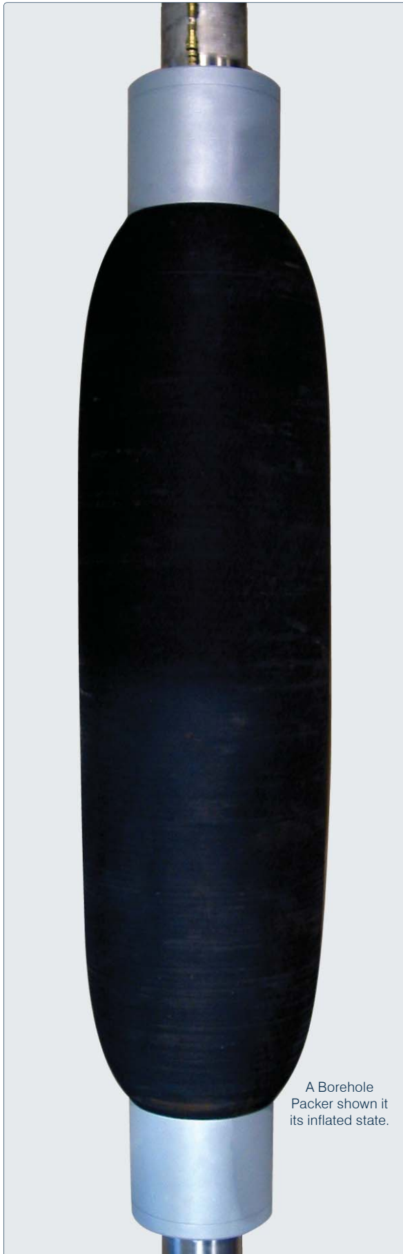
A Borehole Packer shown in its inflated state.