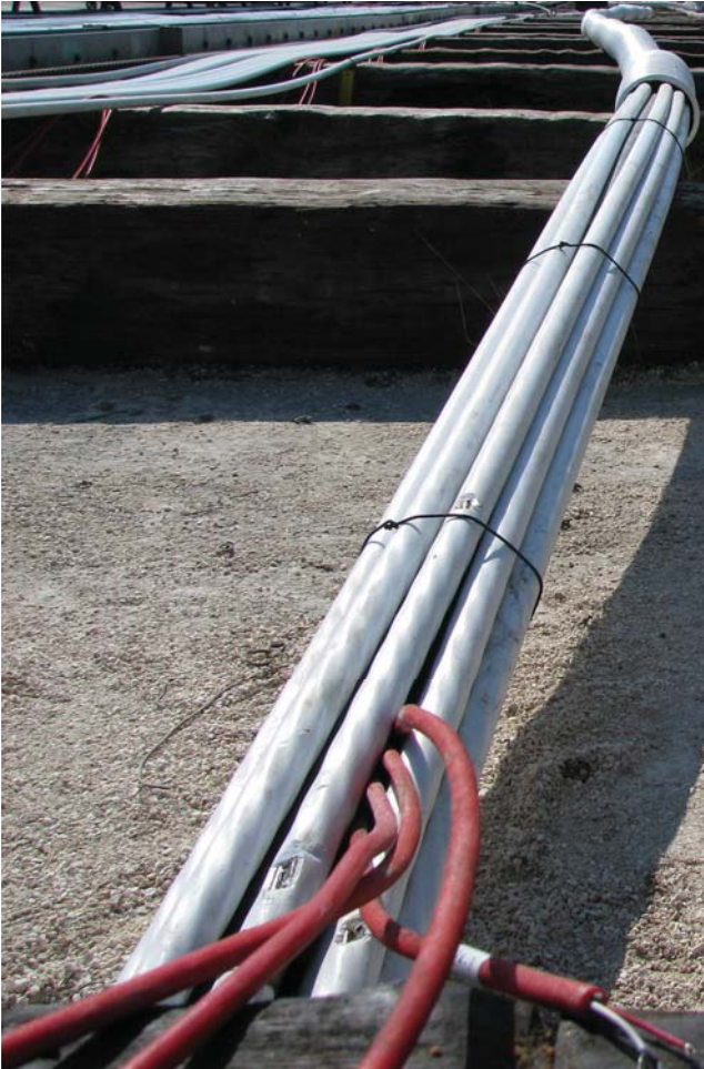
Finished multi-strand anchor with DCP (double corrosion protection) instrumented with 4 TENSMEG gauges.