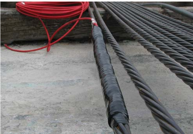
TENSMEG gauge with water proofing installed on one 7-wire strand of a multi-strand anchor.