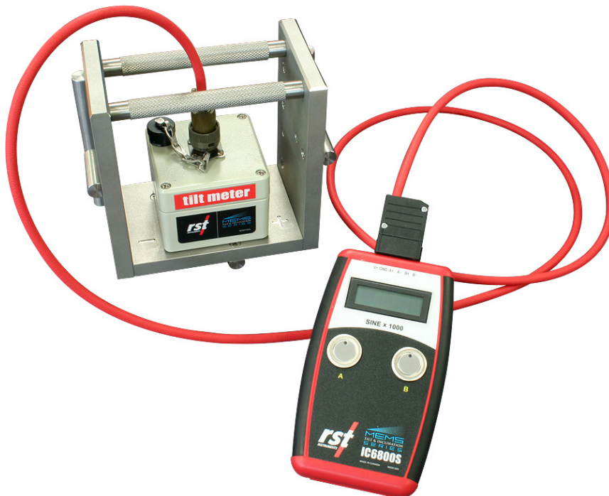
Figure 1: MEMS Portable Tiltmeter & MEMS Portable Tiltmeter Readout

The Tiltmeter is typically read via the RST Model IC6800S MEMS Portable Tiltmeter Readout. All Readouts are configured to display the data in engineering units of (sine \theta ).