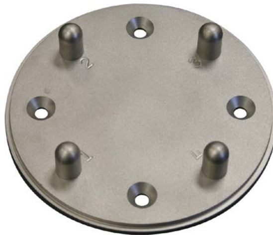
Figure 2: Tilt Monument Plate

The Tiltmeter Monument may be attached to existing concrete using mechanical fasteners, using grout, or a combination of methods. Mechanical fasteners require precise concrete drilling and/or a central adapter plate. The effectiveness of grouts, either cement-type or chemical, is highly dependent on the concrete condition, surface preparation, site conditions and other variables.