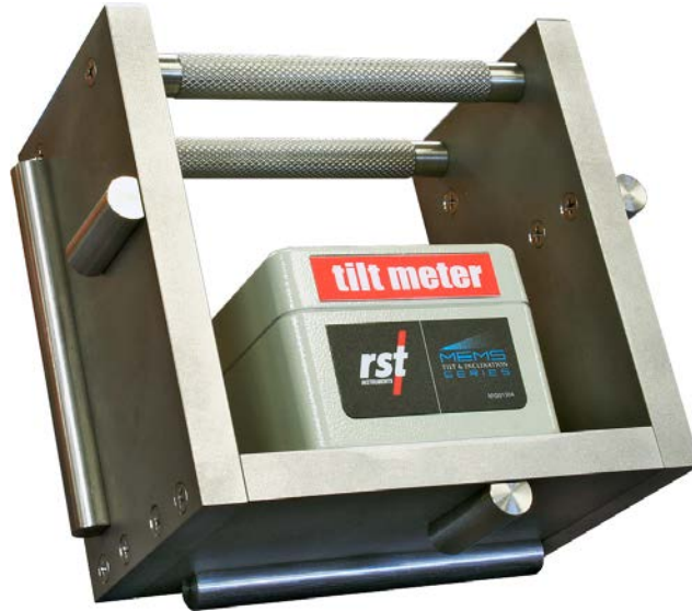
Figure 4: MEMS Portable Tiltmeter alignment bars