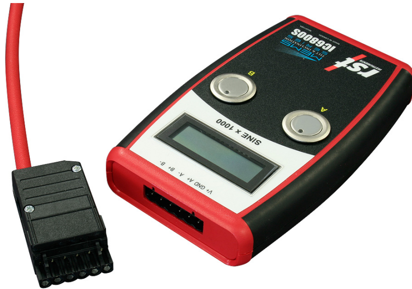
Figure 3: MEMS Portable Tiltmeter readout & connector

Tilt data is displayed by pushing the button A (for axis A of uniaxial and biaxial tiltmeter) and button B (for axis B of biaxial tiltmeter) on the front of the readout (IC6800S) (see Figure 3). The Indicator will display the data in engineering units (sine \theta ). The readout has a built-in low pass filter to block vibrations. The reading will take approximately 3 seconds to stabilize. To conserve battery power, the Indicator will turn itself off after approximately 90 seconds.